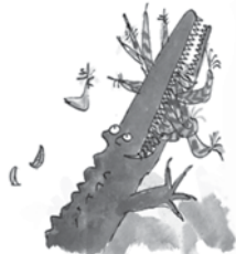
The Enormous Crocodile